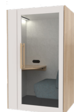
Snow White with Fine Oak sides