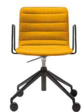
OniPod freestanding, height adjustable chair with castors (4 star base)