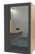
Anthracite with Fine Oak sides