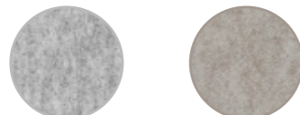
Light Grey (Standard & Oak) Latte (Premium)