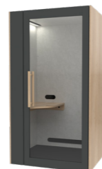
Anthracite with Fine Oak sides