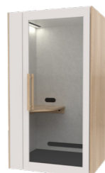
Snow White with Fine Oak sides