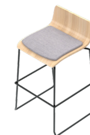
OniPod Phonebooth (standing) freestanding stool with Oak seat (Seat pad sold separately)