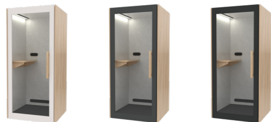
Snow White with Fine Oak sides Anthracite with Fine Oak sides Black with Fine Oak sides