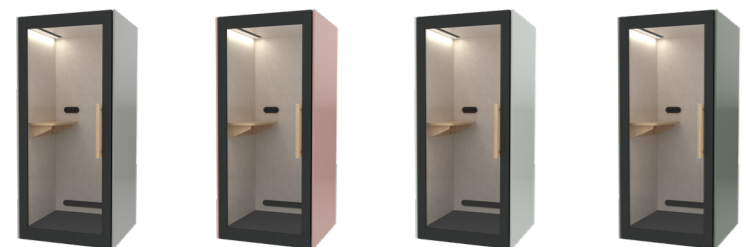
Chinchilla Grey Native Pink Pastel Green Smoke Green