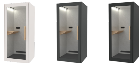
Snow White Anthracite Black