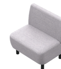
OniPod Phonebooth Plus sofa