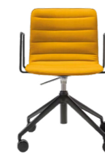
OniPod Phonebooth (sitting) freestanding, height adjustable chair with castors (4 star base)