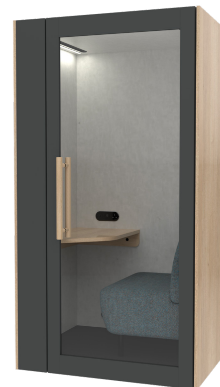
OniPod Phonebooth Plus