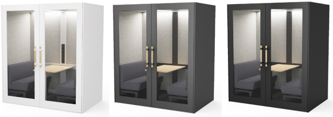
White Anthracite Black