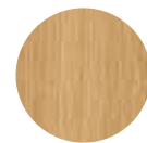
Solid Natural Oak