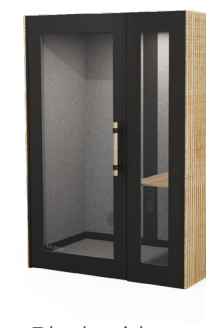
Black with acoustic Corbridge Oak slat sides