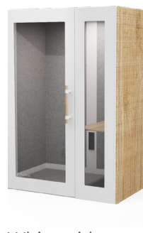
White with acoustic Corbridge Oak slat sides