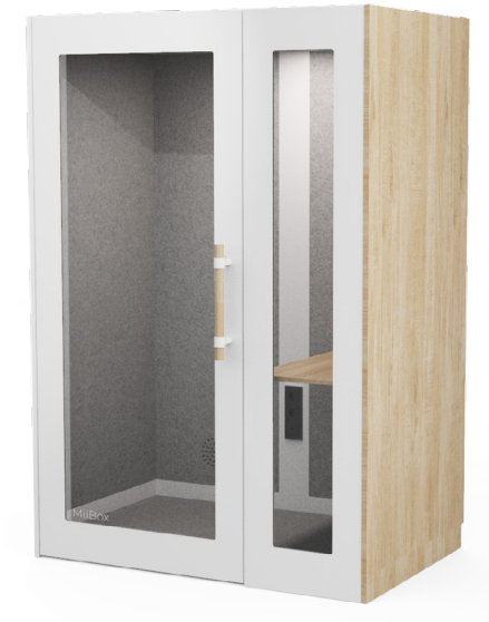
MiiBox ® Workpod