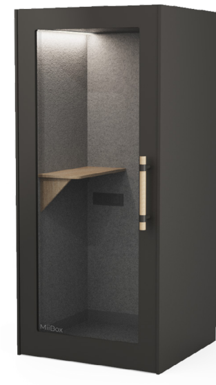
MiiBox ® Phonebooth