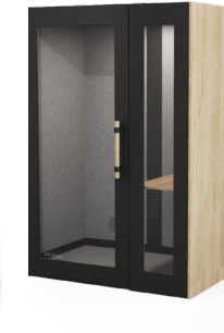
Black with Fine Oak sides