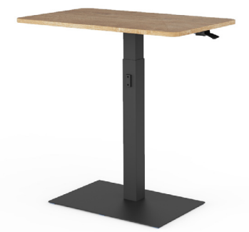
MiiBox® Workpod hydraulic height adjustable desk