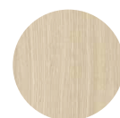
Fine Oak KRONOSPAN 8431