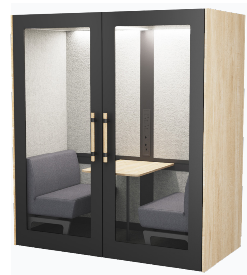
MiiBox ® 2 Person