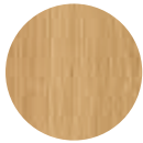
Solid Natural Oak