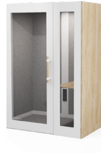
White with Fine Oak sides