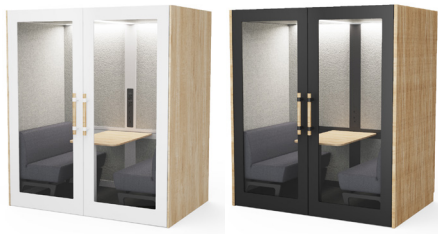
White with acoustic Corbridge Oak slat sides Black with acoustic Corbridge Oak slat sides