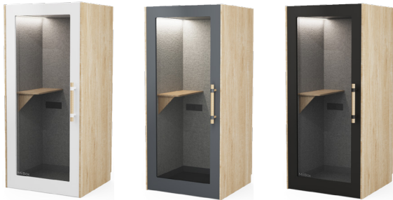
White with Fine Oak sides Anthracite with Fine Oak sides Black with Fine Oak sides