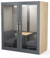
Anthracite with Fine Oak sides