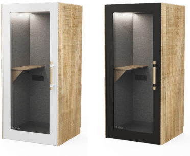
White with acoustic Corbridge Oak slat sides Black with acoustic Corbridge Oak slat sides