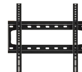
MiiBox® tilting VESA screen mount