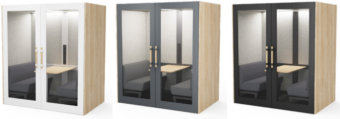
White with Fine Oak sides Anthracite with Fine Oak sides Black with Fine Oak sides