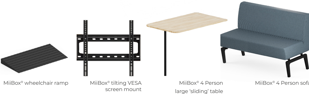
MiiBox® wheelchair ramp