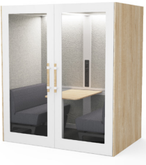
White with acoustic Corbridge Oak slat sides