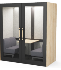
Black with Fine Oak sides