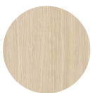
Fine Oak KRONOSPAN 8431