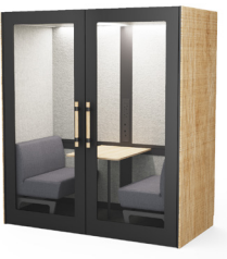
Black with acoustic Corbridge Oak slat sides