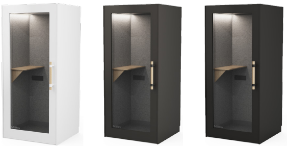
White Anthracite Black