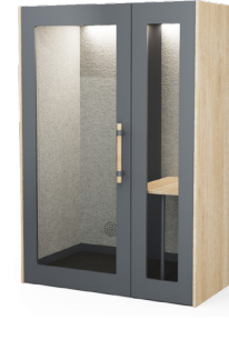
Anthracite with Fine Oak sides