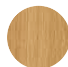
Corbridge Oak EGGER H3395