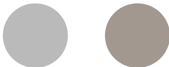
Light Grey (Standard & Oak) Latte (Premium)