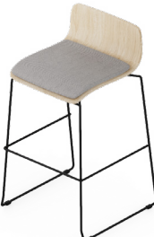
OniPod Phonebooth (standing) freestanding stool with Oak seat (Seat pad sold separately)