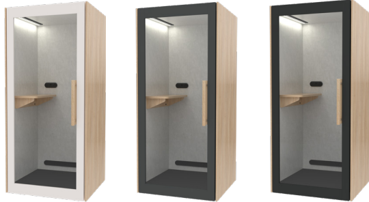
Snow White with Fine Oak sides Anthracite with Fine Oak sides Black with Fine Oak sides