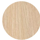
Solid Natural Oak