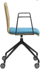
OniPod Phonebooth (sitting) freestanding, height adjustable chair with castors (4 star base) (Seat pad sold separately)