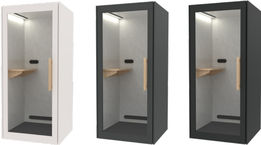
Snow White Anthracite Black