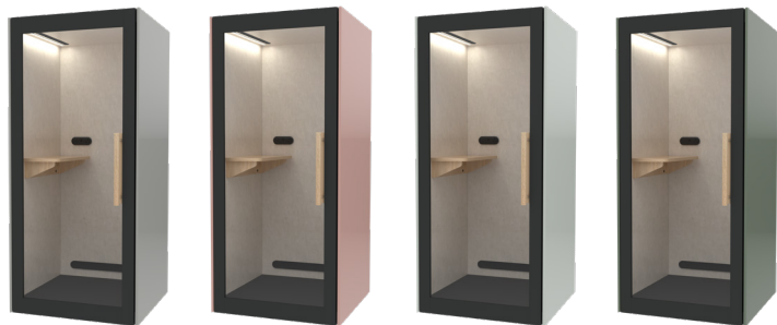
Chinchilla Grey Native Pink Pastel Green Smoke Green