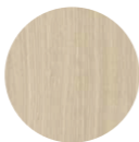
Fine Oak KRONOSPAN 8431 (For OAK spec)