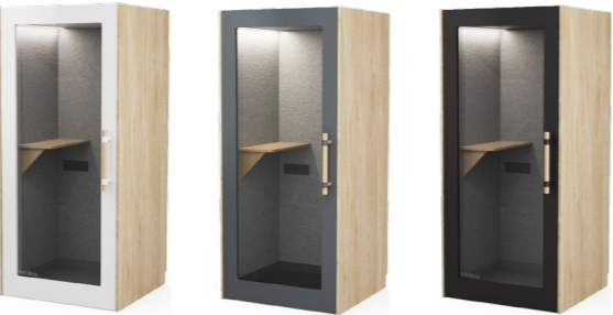
White with Fine Oak sides Anthracite with Fine Oak sides Black with Fine Oak sides