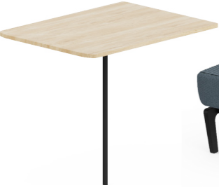
MiiBox® 2 Person large 'sliding' table