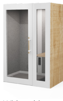
White with acoustic Corbridge Oak slat sides