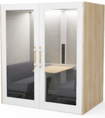
White with acoustic Corbridge Oak slat sides