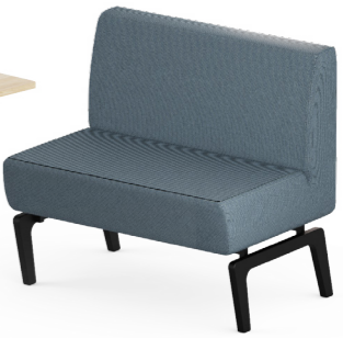
MiiBox® 2 Person sofa