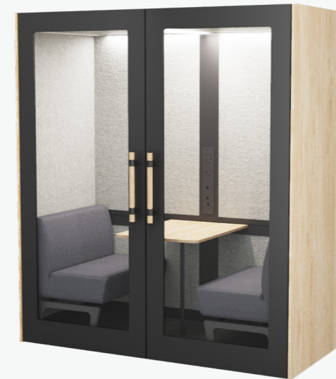
MiiBox® 2 Person