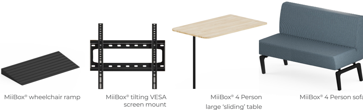
MiiBox® wheelchair ramp