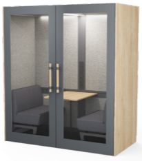
Anthracite with Fine Oak sides