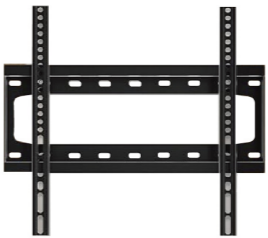
MiiBox® tilting VESA screen mount