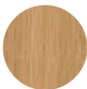
Corbridge Oak EGGER H3395 (For STD & LUX spec)