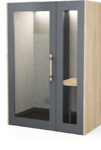
Anthracite with Fine Oak sides