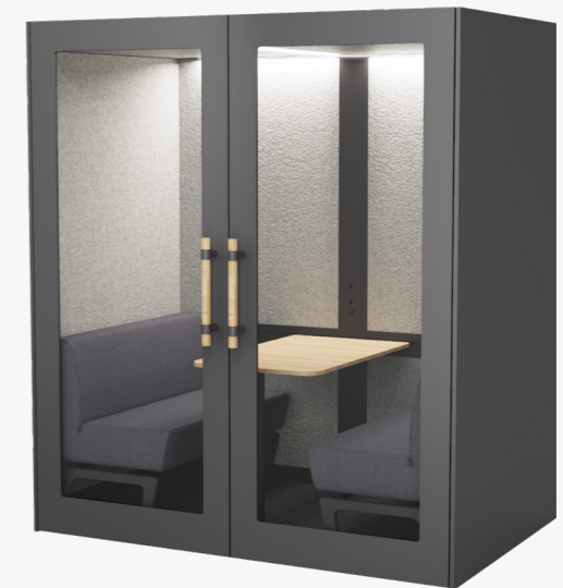
MiiBox® 4 Person