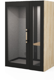
Black with Fine Oak sides