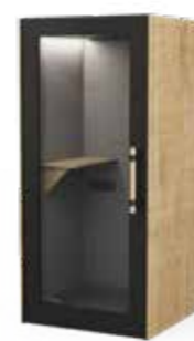
Black or White with wooden slats