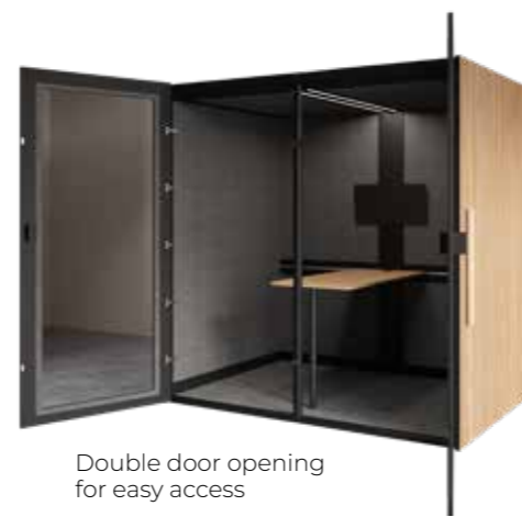
Double door opening for easy access