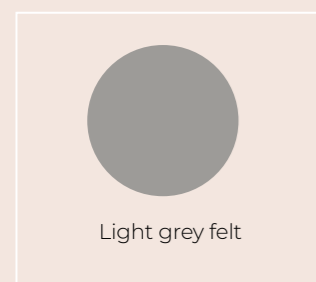
Table & Handles