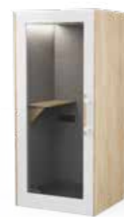
Black/White/Anthracite with light oak sides